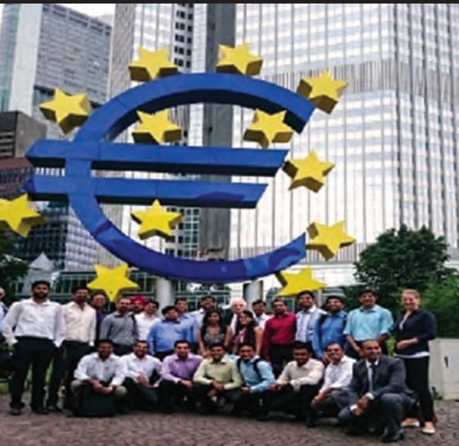
Visit to Deutsche Bundes Bank - German Central Bank