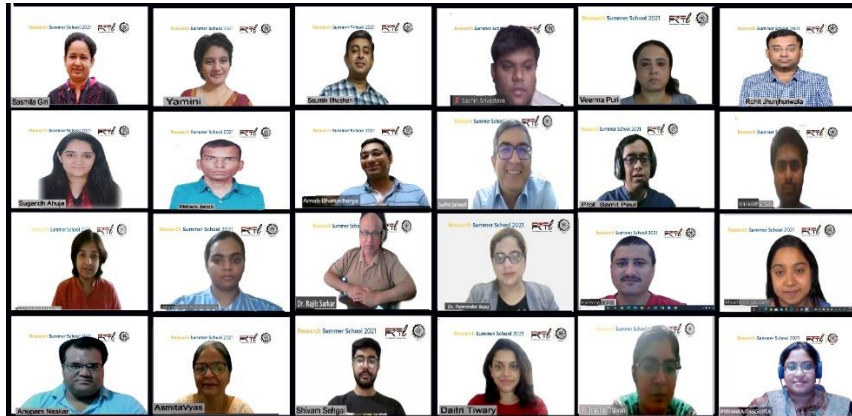
Research Summer School 2021