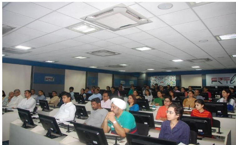
Research Summer School 2017