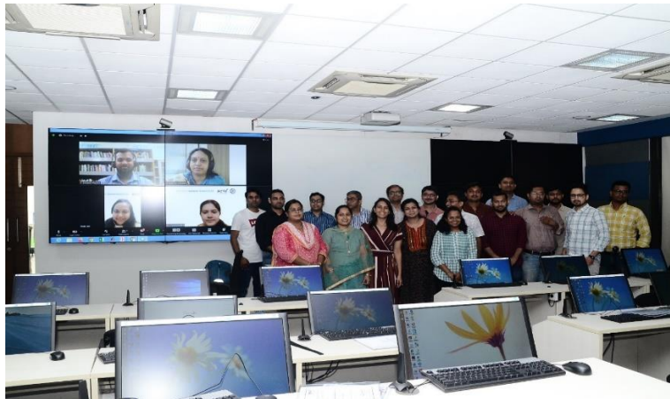
Research Summer School 2022