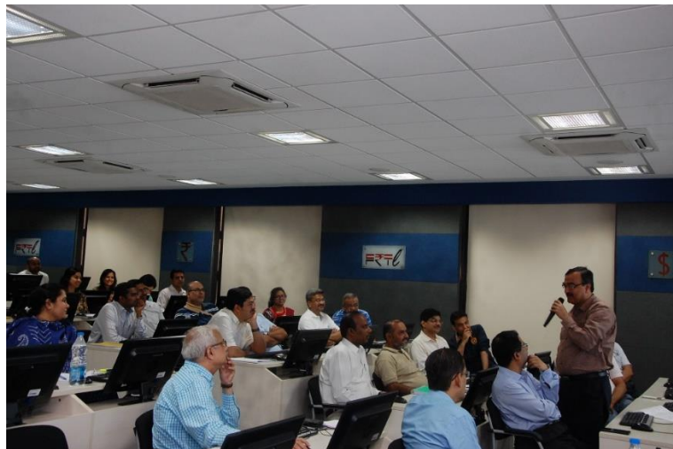
Research Summer School 2016 inauguration ceremony