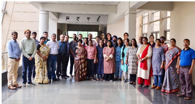
Research Summer School 2023