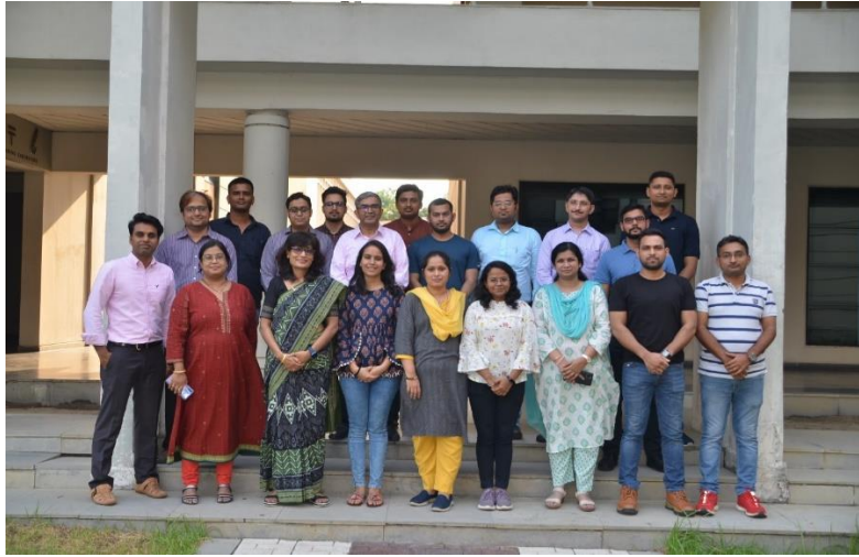
Research Summer School 2022